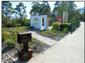
Cranbourne BG Display Garden