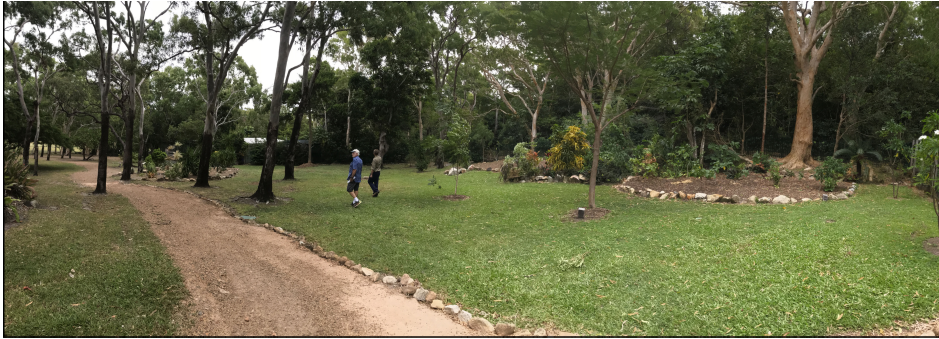
Photo SW at the intended area for the 19th, 20th & 21st gardens

These gardens would display plants, garden styles and feature typical of the 18th, 19th, 20th & 21st centuries. They could include facade of building with historical context to the period being displayed. They could be styled to show features common to all periods, for example they could represent what typical front yards would look like for each period. Also included would be a Gondwana section preceding the other gardens, which would include examples of plant genera and species with evolutionary connections to Gondwana