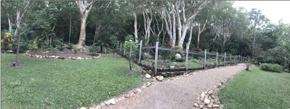
CBG's existing 1800's fenced display garden would be incorporated into the feature