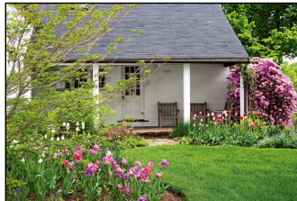
Historical Facade Display Garden